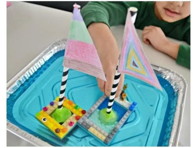
FLOAT A BOAT science experiment